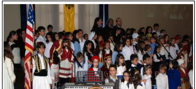
The Holy Cross Sunday School Students perform.